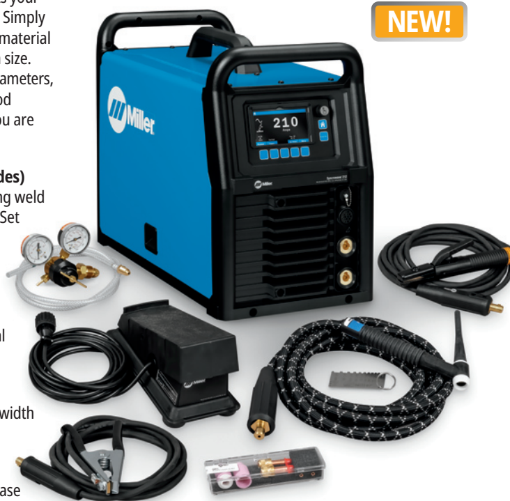
Air-Cooled Ready-to-Weld Package shown (see page 5).

DIG (stick) control allows the arc characteristics to be changed for specific applications and electrodes. Lower the DIG setting for smooth running electrodes like E7018 and increase the DIG setting for stiffer, more penetrating electrodes like E6010.