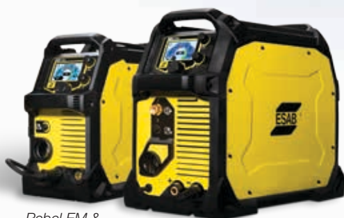
Rebel EM & EMP 215ic